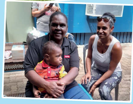
Halloween on Hammond