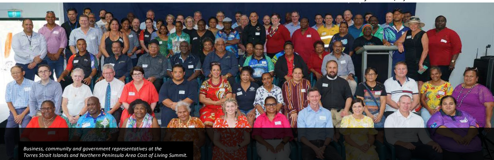
Business, community and government representatives at the Torres Strait Islands and Northern Peninsula Area Cost of Living Summit.